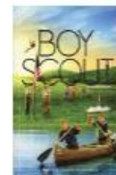
Scouts BSA (Boys & Girls Ver.) $17.99